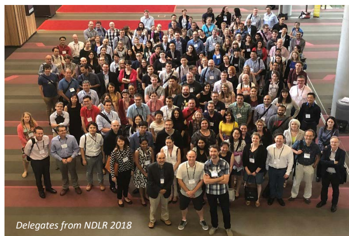
Delegates from NDLR 2018